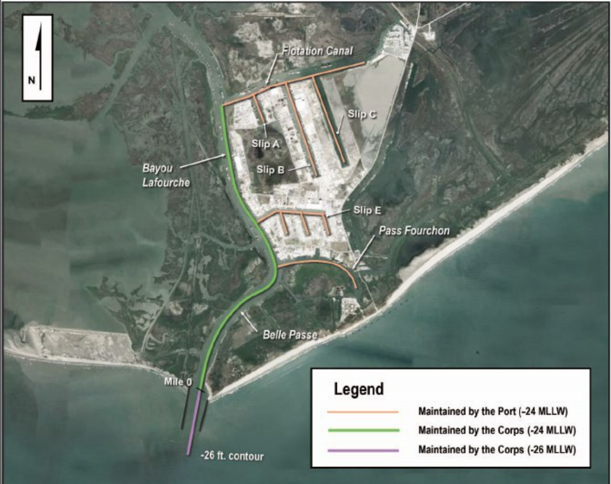
Figure 2. Project Area Map, Green Line is Inland Reach, Purple Line is Offshore Reach